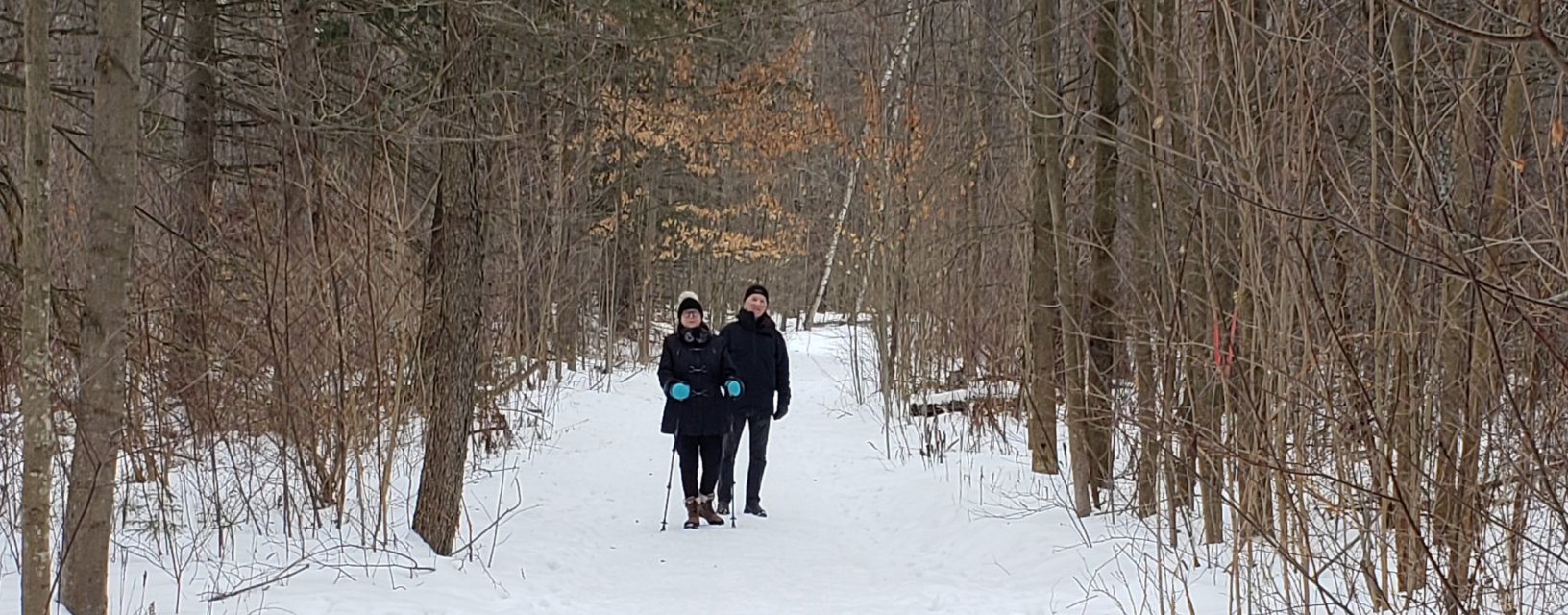
Clarke Tract Forest has the advantage of being [above] Wonderful walkers from Newmarket, [below left] Dog mayhem - 6 dogs re-leashed after a collision, [below right] A metro-bus wide trail in Clarke Tract.