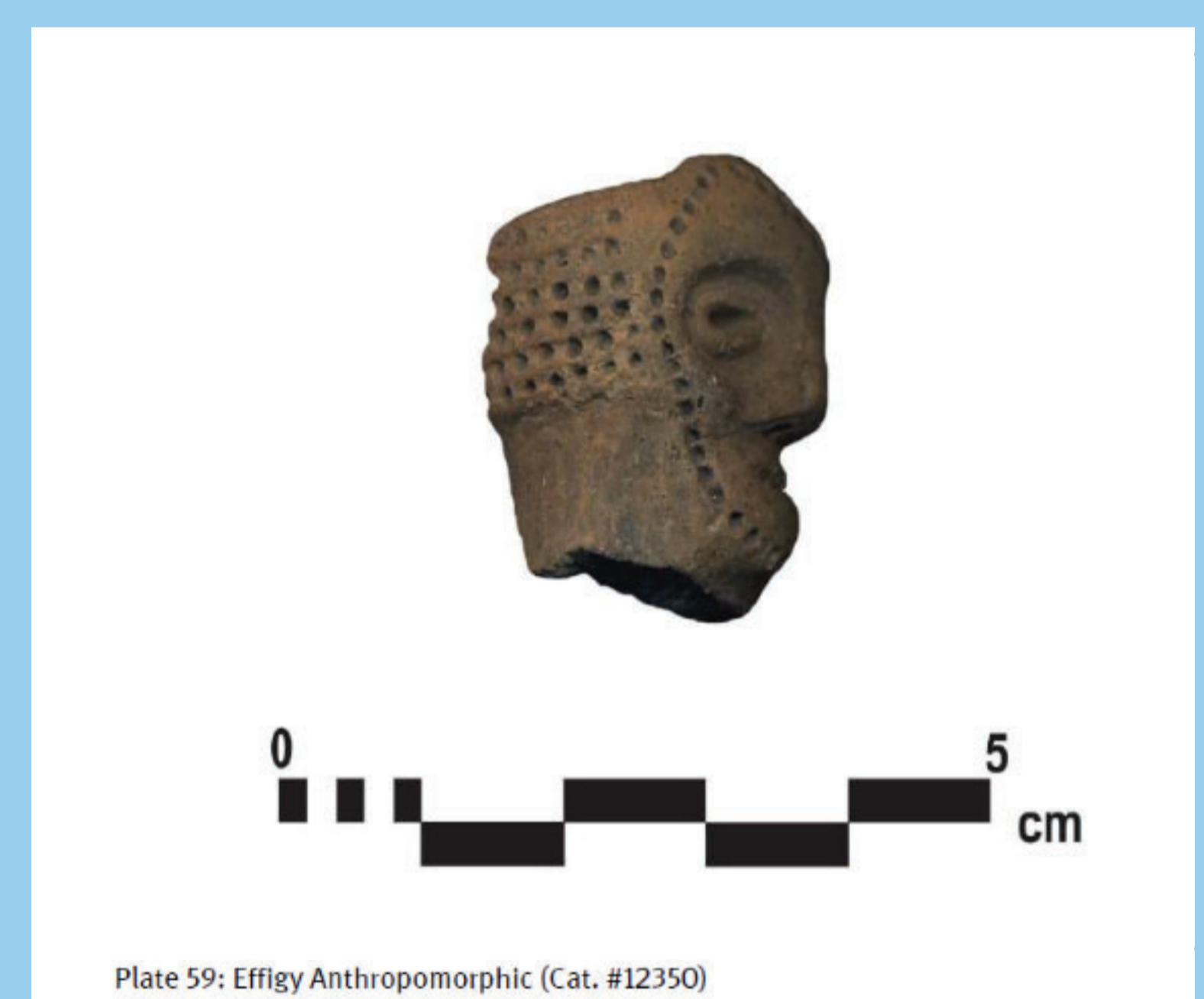
Plate 59: Effigy Anthropomorphic (Cat. #12350)

Effigies are sculptures created to represent living things, such as animals and humans. The two shown above, were among those uncovered at the site.